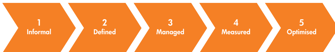
Figure 1: The maturity map helps you determine where to focus and which steps to take next.